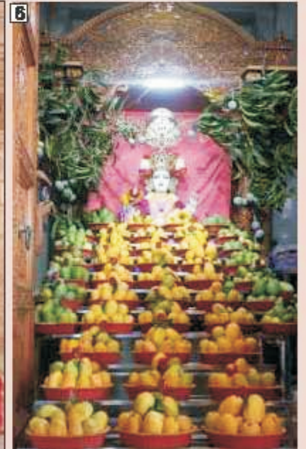
(1) Rathayatra Darshan In Parsippany (America) temple. (2) Rathayatra Darshan organized by our temple on the roads of New York. (3) Rathayatra and Jambu Utsav Darshan organized by our New Ranip temple. (4) Annakut Darshan In front of Thakorji on the occasion of Patotsav of Ayodhya temple. (5) Artistic Hindola Darshan in front of Thakorji in Mehsana temple. (6) Amrotsav Darshan in Gandhinagar Sector-2 temple.